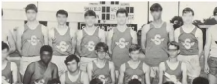
Look For Any High School Yearbook, It's Free