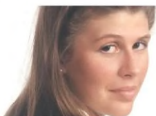
Look For Your Old High School Yearbook, It's Free