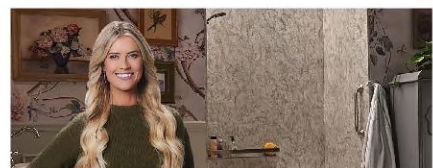
Here's How Much A 1-Day Walk In Shower Costs In Virginia