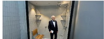
Here's An Estimated Cost For A 1-Day Walk-In Shower