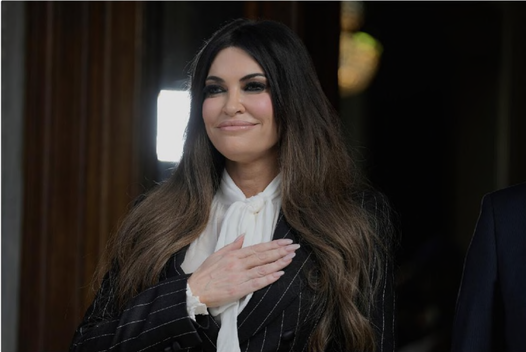
Former Fox News host Kimberly Guilfoyle takes up position as US ambassador to Greece