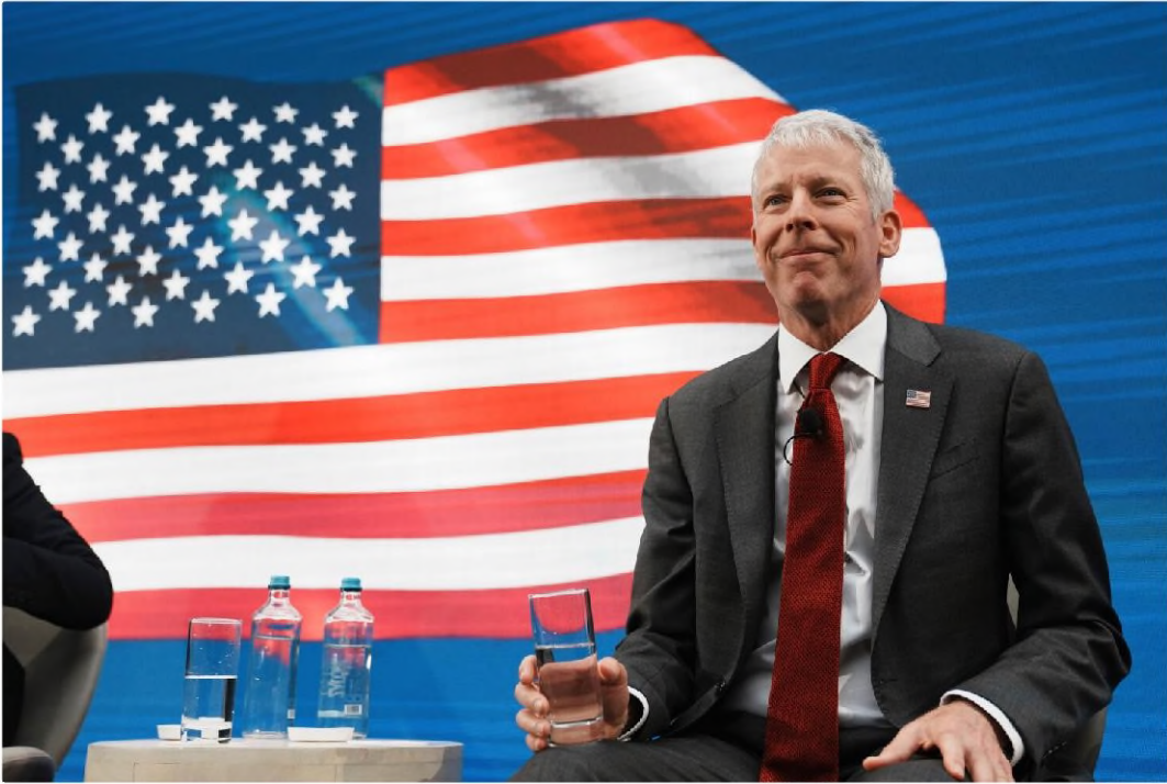
US urges Europe to move faster to phase out Russian gas, expand pipeline networks to Ukraine