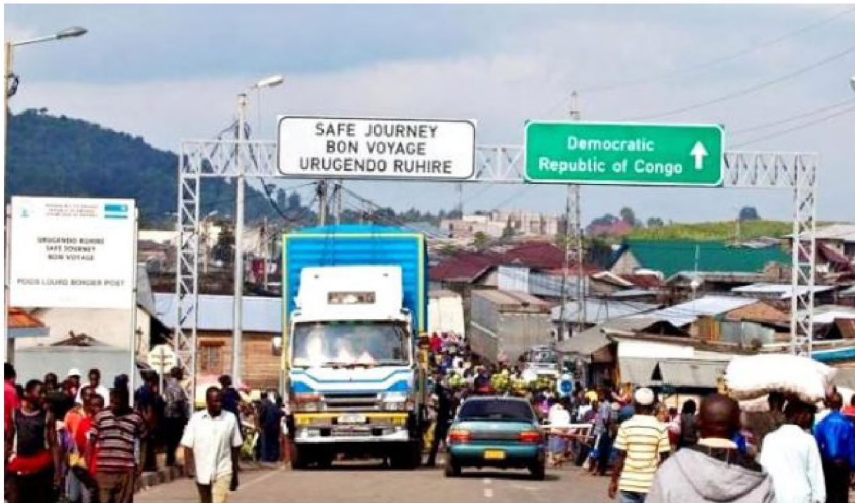
Small scale traders from DRC and Rwanda

Rwanda's external trade performance in the third quarter of 2025 underscores the Democratic Republic of Congo (DRC) as the single most important driver of the country's export recovery, highlighting deepening economic interdependence with its western neighbour.