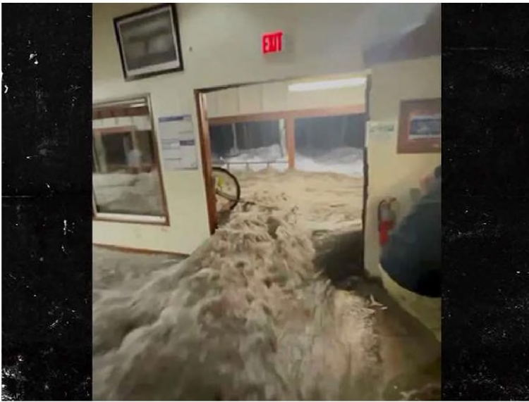
Instagram / @worldmaverik

Some hold onto whatever they can find ... others climb on top of withholding furniture as the powerful stream of water continues surging in.