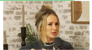
Kylie Jenner Stuns