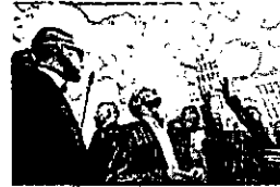
Minister for Foreign Affairs Heiko Maas at the Wunderbar Together opening celebrations

Our friendship with the United States means a lot to us, as we know it does to many Americans. That is why people will be at the heart of this year of German-American friendship. Over the coming months, we would like to renew the dialogue with our American friends about the importance of our relationship and how we can shape it for the future. As we face shared challenges and societies become more divided, we must build more — and stronger — bridges between our peoples.