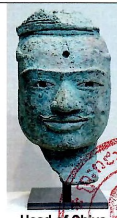
Head of Shiva Bronze with silver inlay, Angkor period, Koh Ker style, 10th C.