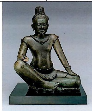
Bodhisattva Avalokiteshvara Copper alloy with silver inlay, Angkor period, 10th-early 11th C.