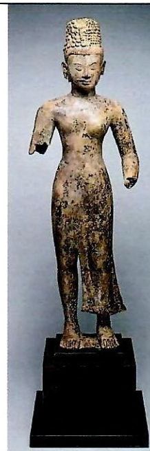
Ardhanarishvara Bronze, Pre-Angkor period, 7th-8th C.