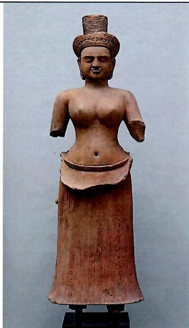
Female deity (Uma) Sandstone, Angkor period, Koh Ker style, 10th C.

The Minister concluded: "These returns contribute to the reconciliation and healing of the Cambodian people, who endured decades of civil war and suffered tremendously from the tragedy of the Khmer Rouge regime. They also demonstrate the truly positive partnership we have developed with the United States."