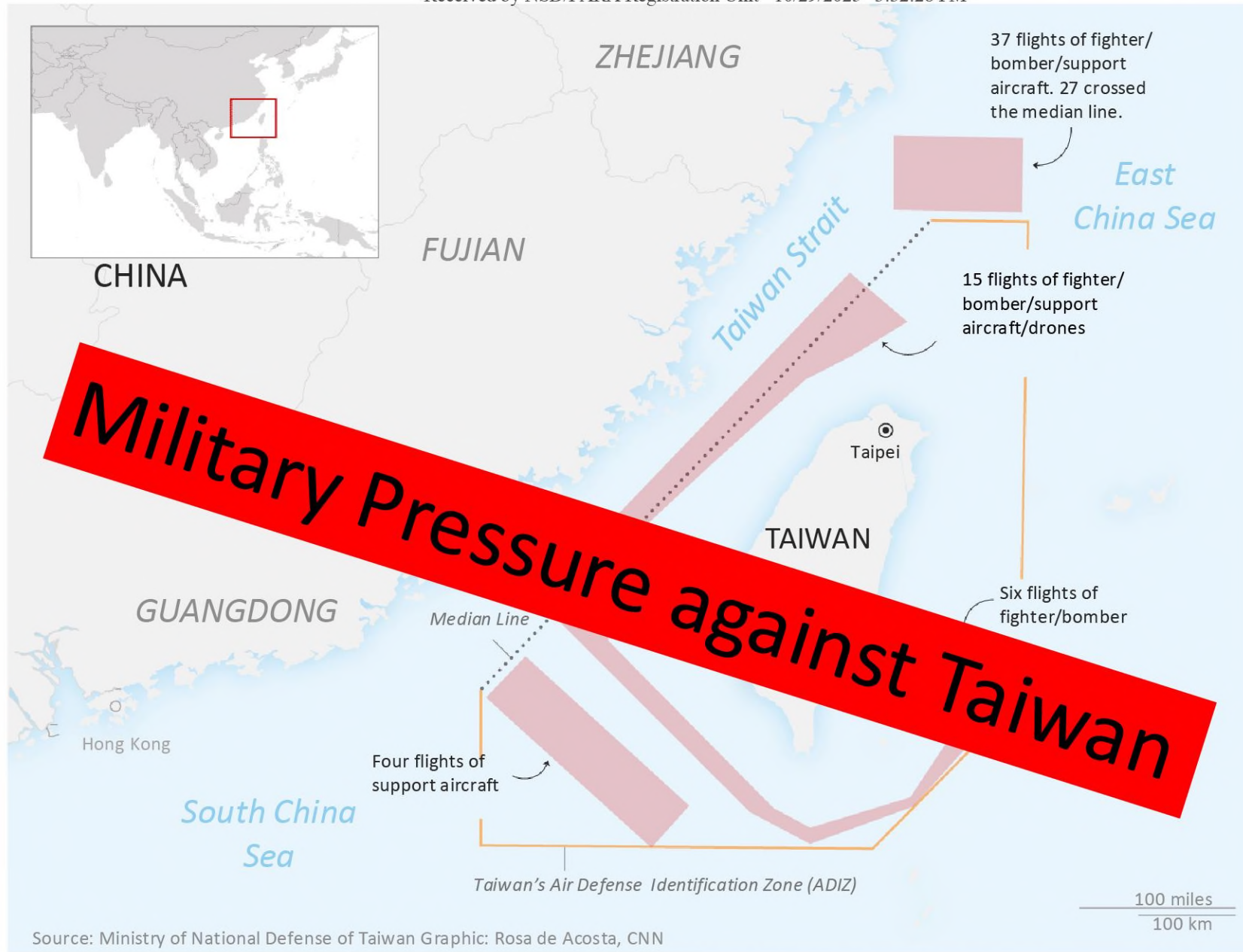
Areas where Taiwan recorded Chinese air force activity between April 1, 6 a.m. and April 2, 6 a.m. local time