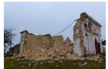
Before-and-after images of a Catholic church in Kyselivka, Mykolayiv, following Russian shelling in May 2022.

This material is distributed by PLUS Communications LLC on behalf of Stand with Ukraine. Additional information is available at the Department of Justice, Washington, DC.