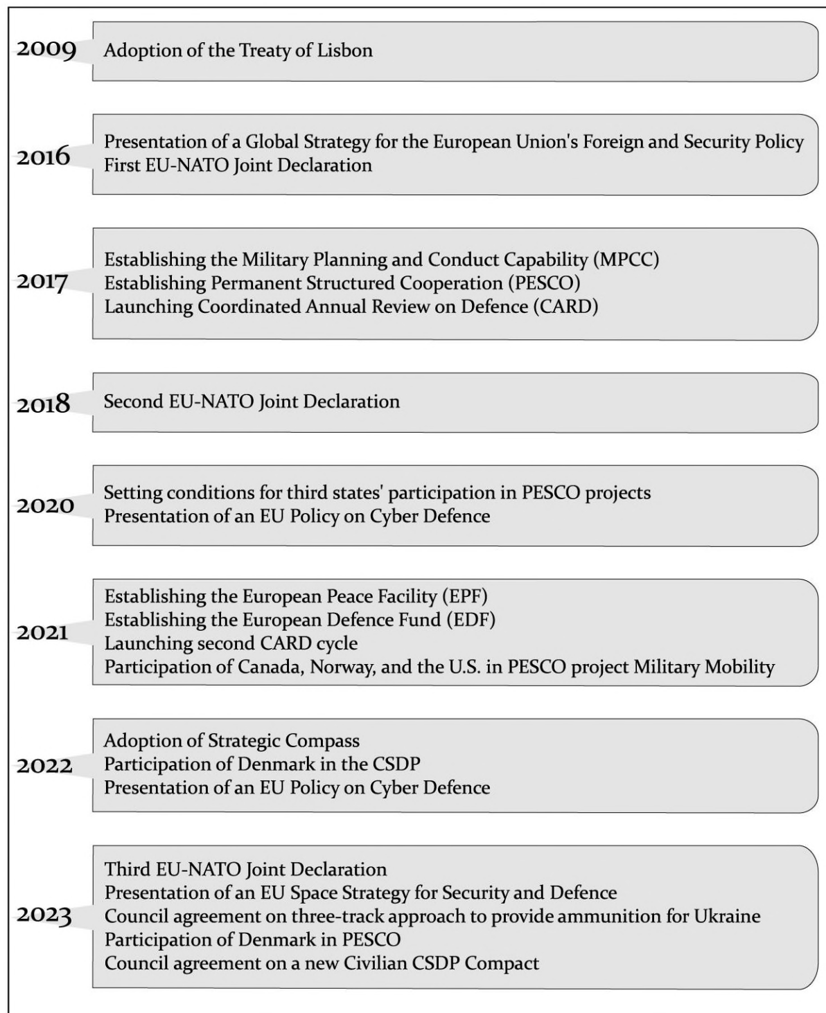
Figure 1. Evolution of the Common Security and Defence Policy