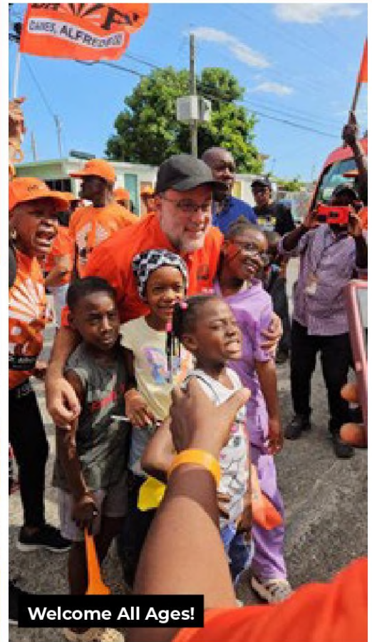
Welcome All Ages!