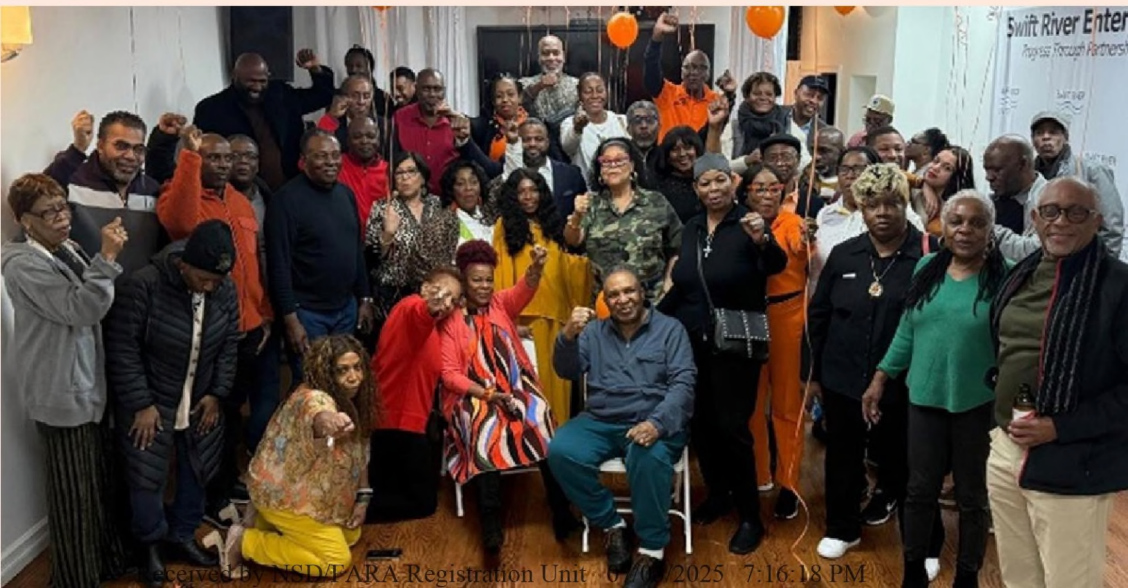
Attendees at the February, Northeast USA gathering in NY