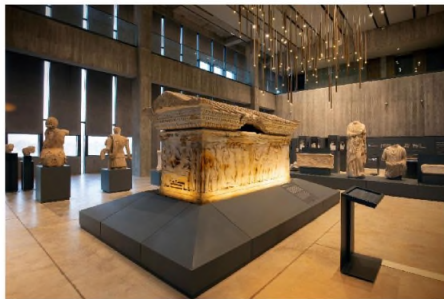
Exhibit in the Museum of Troy