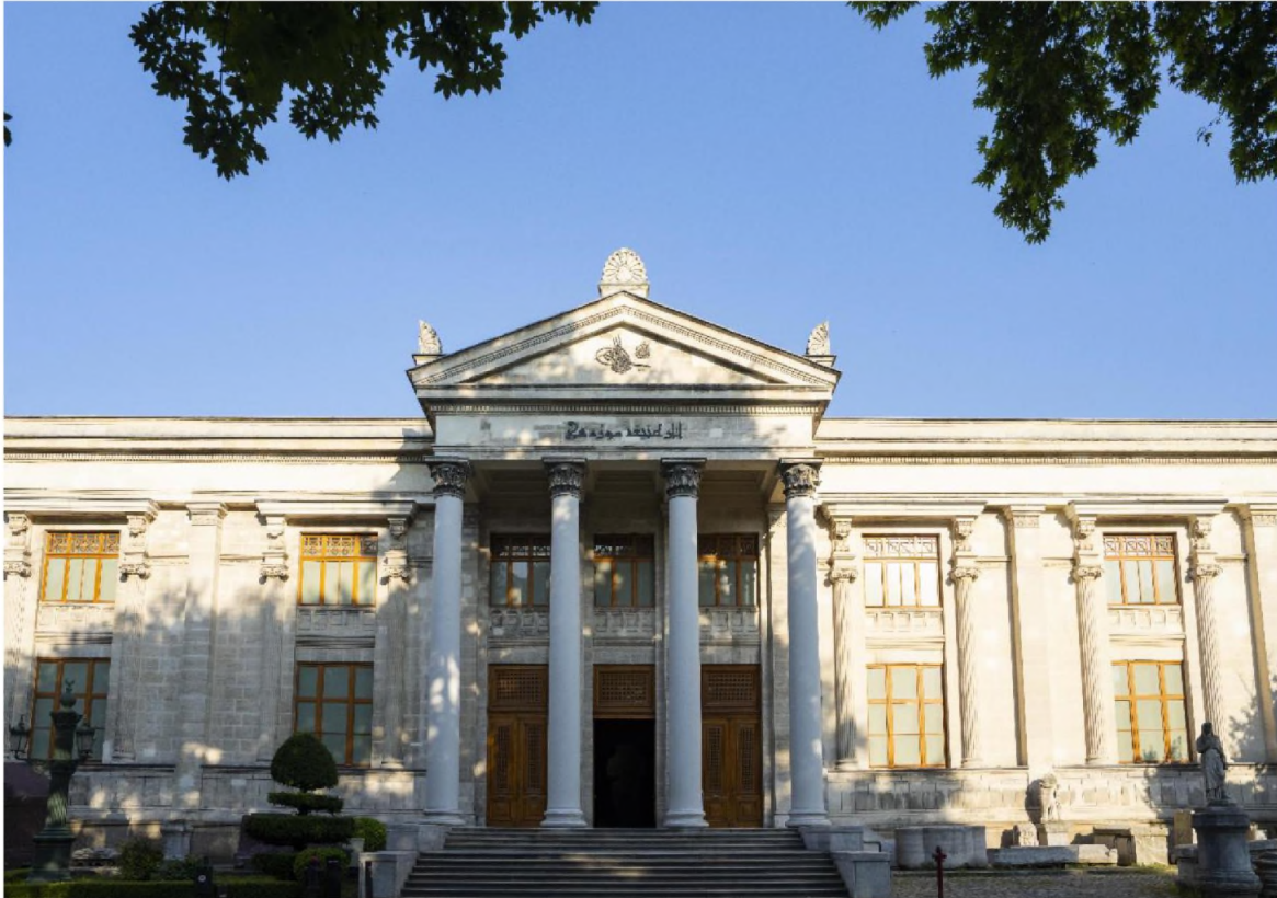
Exterior of Istanbul Archaeological Museum

New York - May 17, 2024: Türkiye celebrates International Museum Day tomorrow by focusing on some of the country's most classic institutions, specializing in this year's concentration on "Museums for Education and Research," that emphasizes learning, discovery and cultural understanding.