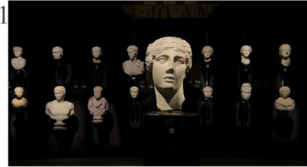
Collection of busts at Istanbul Archaeological Museum