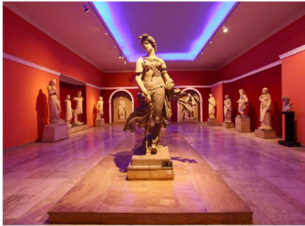
Collection of statues in Antalya Archaeological Museum