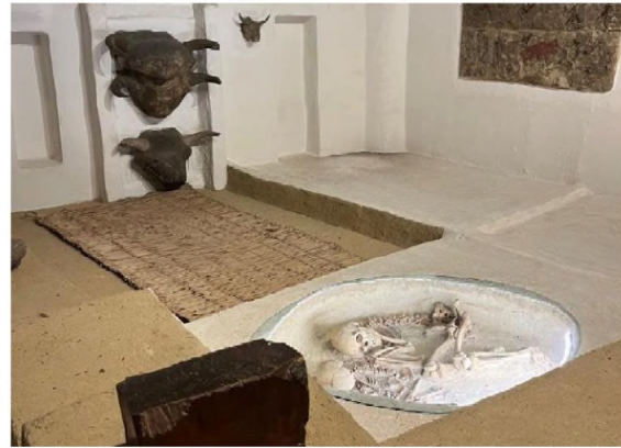
Replica of a room from Çatalhöyük, a settlement dating back to 7500-5600 BCE, at the Anatolian Civilizations Museum

Central to Türkiye's submission are the many ways in which the city's layout and structures reflect the cultural importance of Ankara. The İş Bank is emblematic of the country's approach to economic reconstruction during the Republic era. Institutions like the Faculty of Language, History and Geography, as well as cultural organizations such as the State Opera and Ballet and Ankara Radio, demonstrate the new government's focus on arts and communication. Investment in these areas allowed Ankara to become the world-class city it has become, earning its spot under UNESCO's consideration.