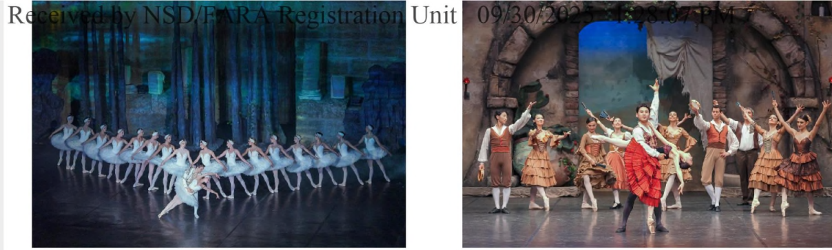
Swan Lake