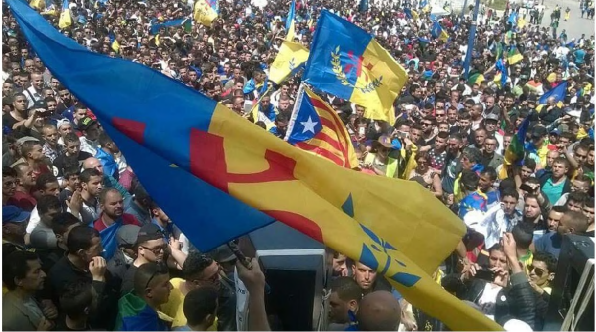
March on the 20/04/2016 in Vgayet organised by the MAK