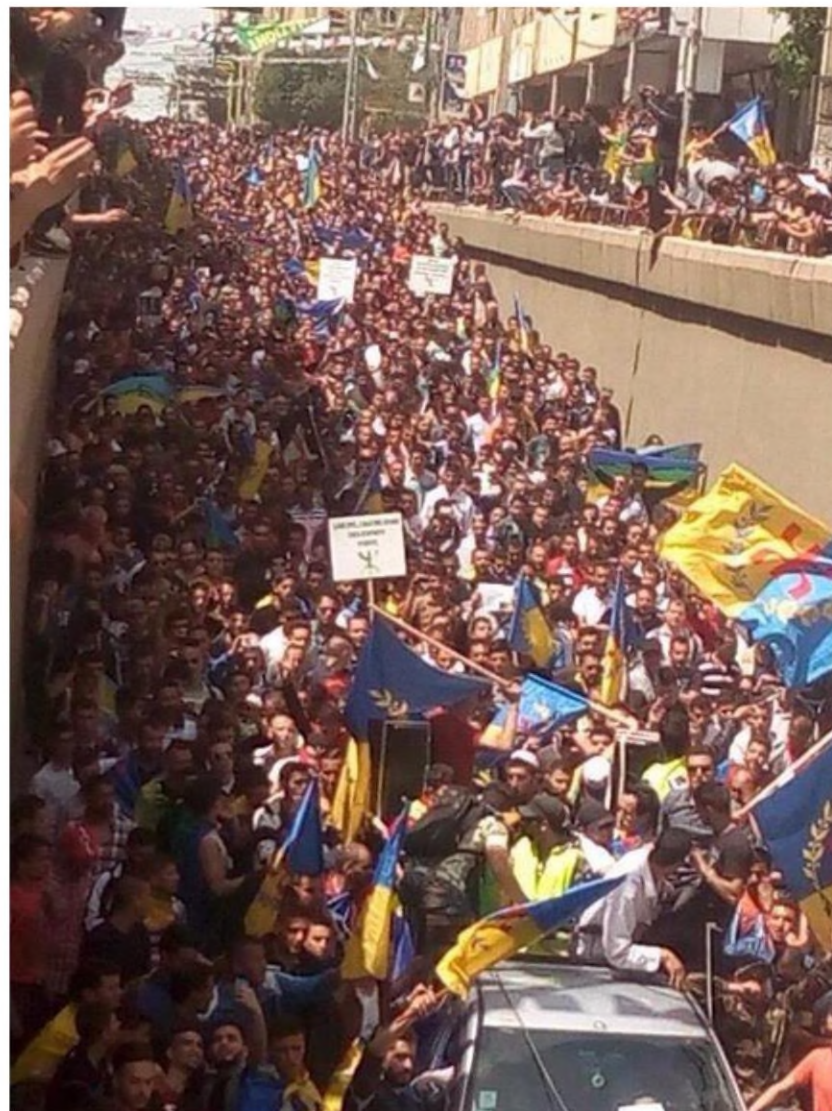
March on the 20/04/2016 in Tizi-Ouzou called by the MAK