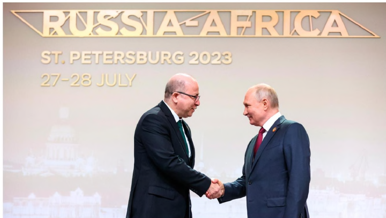
Algerian Prime Minister Aymen Benabderrahmane, left, and Russian President Vladimir Putin shake hands before an official ceremony to welcome the leaders of delegations to the Russia Africa Summit in St. Petersburg, Russia, Thursday, July 27, 2023.

The July 26 coup in Niger retains the potential for inciting both a continental African and international crisis.