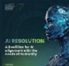
Resolutions on Key Issues