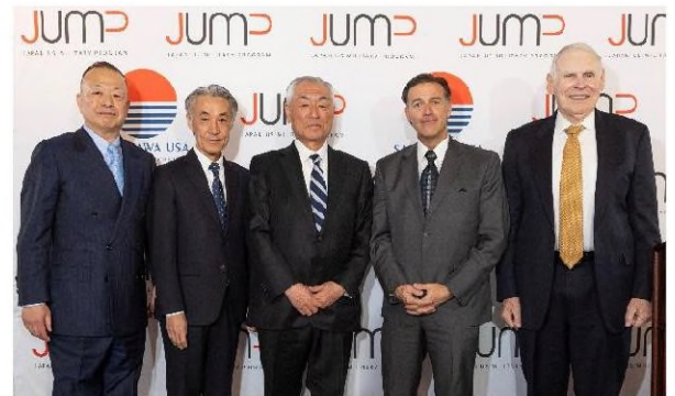
JUMP Annual Dinner in 2025 with General Ryoichi Oriki (JGSDF, Ret.), Admiral John C. Aquilino (USN, Ret.) and Admiral William Fallon (USN, Ret.)