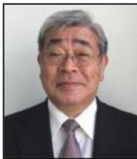
Lt Gen Hirata