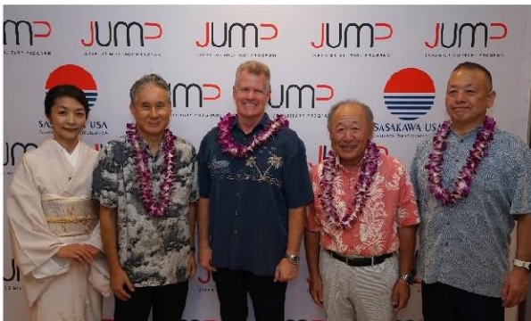
JUMP event in Honolulu in 2024 with Admiral Samuel Paparo (USN) and Admiral Katsutoshi Kawano (JMSDF, Ret.)

The JUMP Annual Dinner brings together prominent leaders from the JUMP community to connect and engage with one another. Held in Washington, DC, it is a yearly highlight on the JUMP calendar. The 2025 JUMP Annual Dinner featured distinguished guests and speakers, including General Ryoichi Oriki (JGSDF, Ret.), Third Chief of Staff, Joint Staff of the Japan Self-Defense Forces; Ambassador Shigeo Yamada, Ambassador Extraordinary and Plenipotentiary of Japan to the United States of America; and Admiral John C. Aquilino (USN, Ret.), former Commander of the U.S. Indo-Pacific Command.