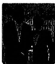
Alex Soros Shares Photo wit... Euronews Albania