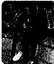
Alexander Soros - Ending su... Facebook