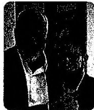
Alex Soros calls Edi Rama his...