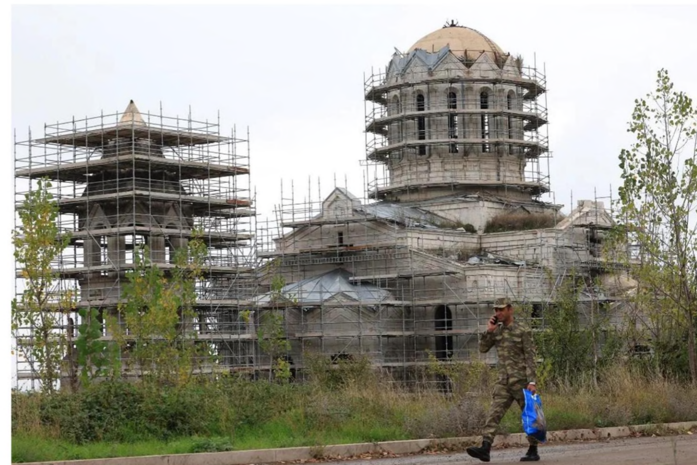
Chouchi cathedral converted into mosque

The appropriation of the Armenian monastery of Dadivank