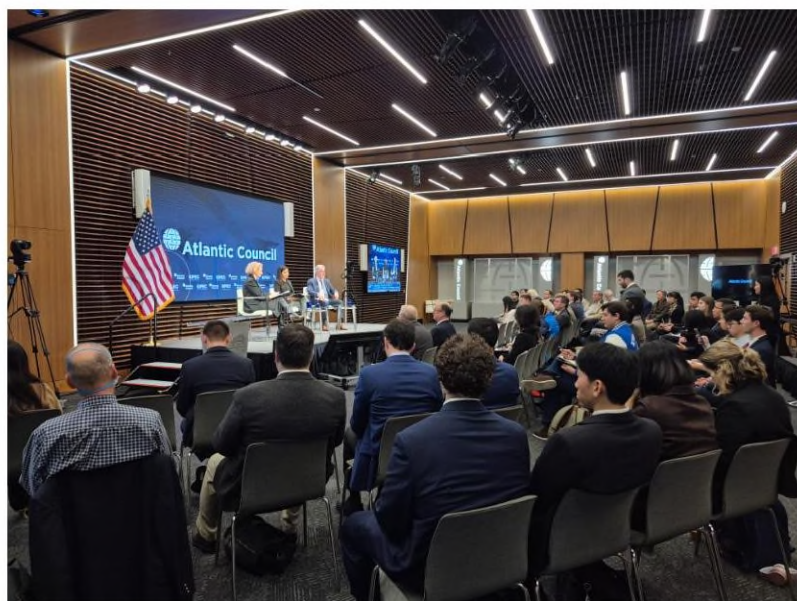
November 5, 2025

https://kipec.org/ko/bsr/board.php?bo_table=event&wr_id=14