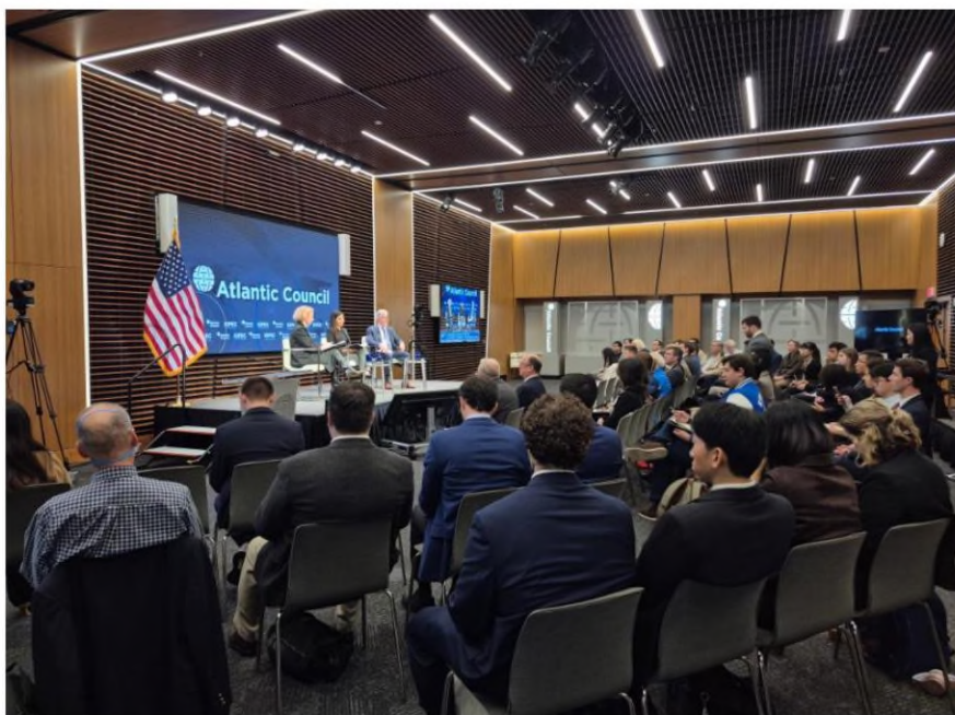
일시: 2025년 11월 5일 (수)

KIPEC, in collaboration with the Atlantic Council's Indo-Pacific Security Initiative and Economic Statecraft Initiative, held the first joint event to analyze the key outcomes of the Asia-Pacific Economic Cooperation (APEC) Summit. Further details can be found in the upcoming No. 16 KIPEC Brief, which will be available in the Reports section.