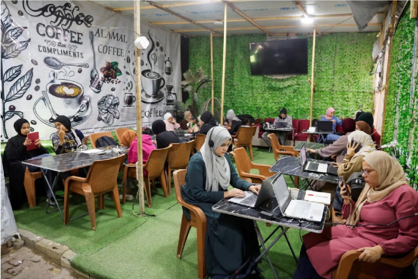
Palestinian students studying inside a cafe in Khan Younis on April 6, 2026.

Recent reporting [1] highlighted images and videos from Gaza showing luxury cafes, crowded beachfront venues, and social gathering spots operating despite the ongoing conflict. This has undermined claims that Gaza is experiencing a genocide or total humanitarian collapse.