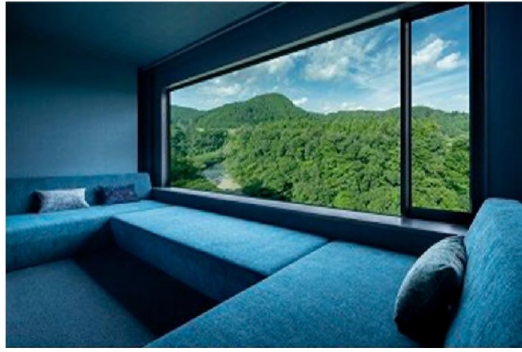
Hoshino Resorts KAI Akiu in Miyagi (April open)