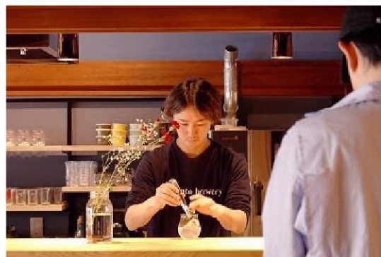
Making a Sake based cocktail