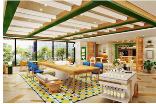
Royal Park Hotel Ginza 6-chome in Tokyo (May open)