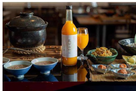
Hotel Granvia Wakayama Discover Local Flavors at Hotel Granvia Wakayama's Breakfast Buffet