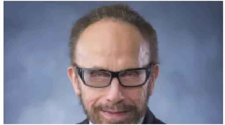
FOUTS: Growing senior population demands action