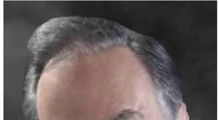
Column: Hey, America: Stop complaining