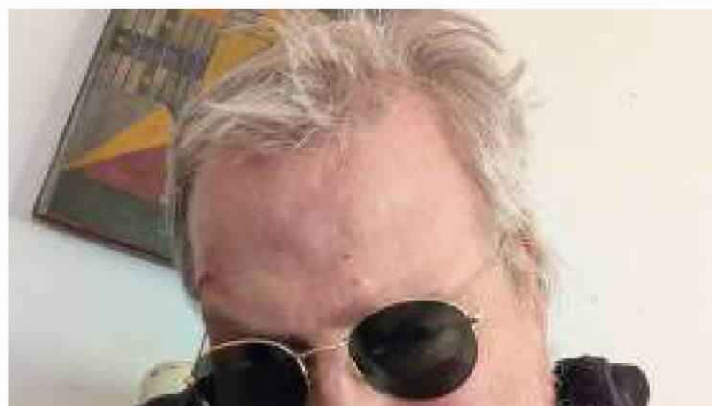
Column: Hey, America: Stop complaining