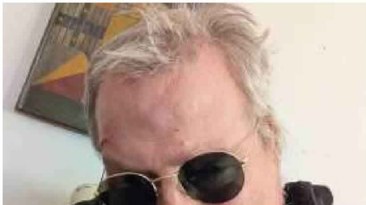
Column: Through the past brightly, May 30