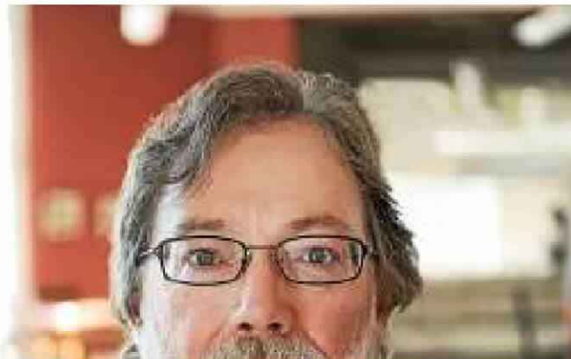
Column: Kicking against the chicken littles