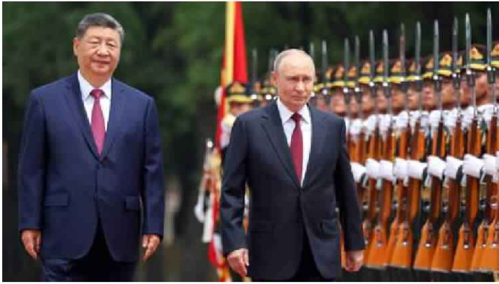
O'NEILL: Current Cold War worse than the last