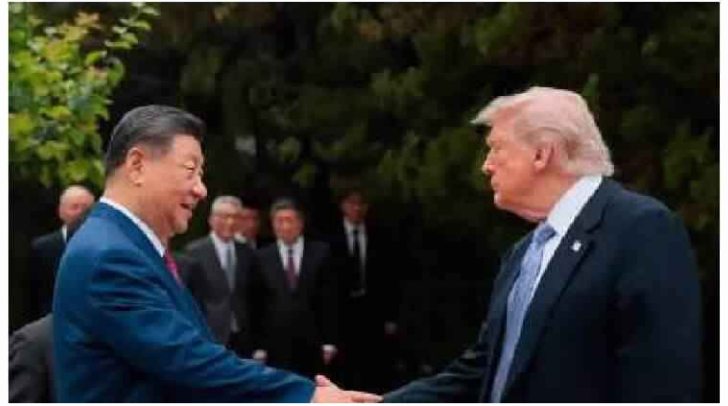
O'NEILL: Trump seems poised to abandon Taiwan