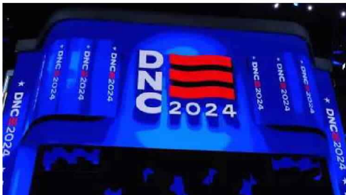
O'NEILL: Unity continues to elude Democrats